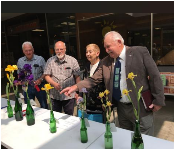
Exhibition Judging Prairie Iris Society