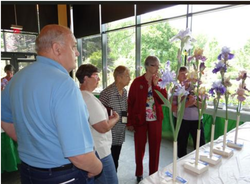
NIIS Morton Arboretum Lisle, IL