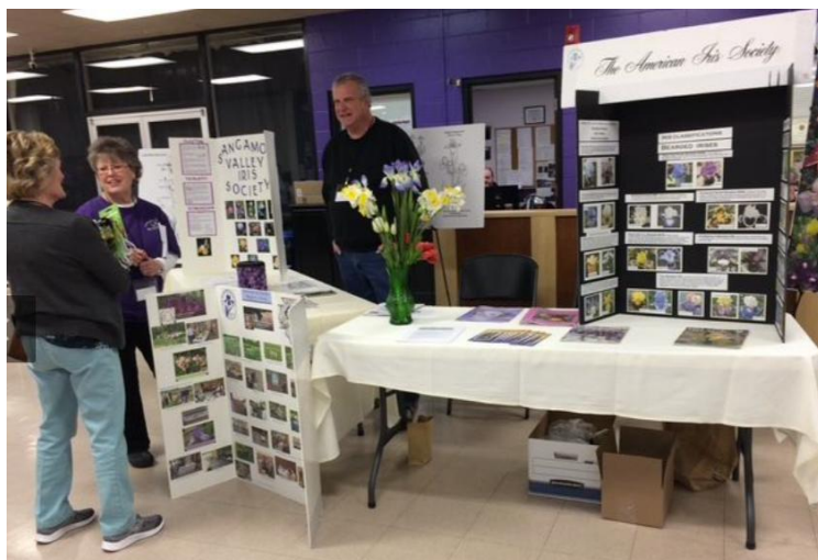
Attended Master Gardener Day Lincoln, IL