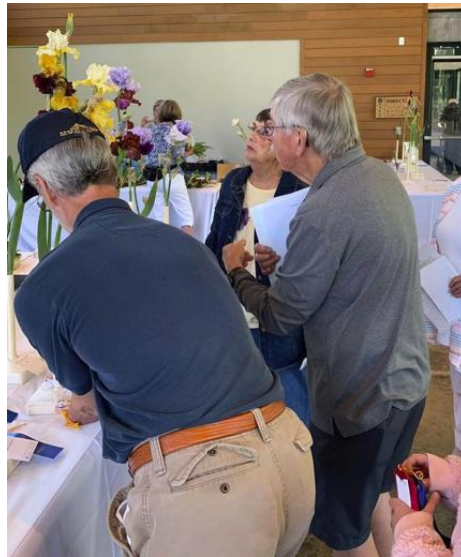
Judging Iris Show,