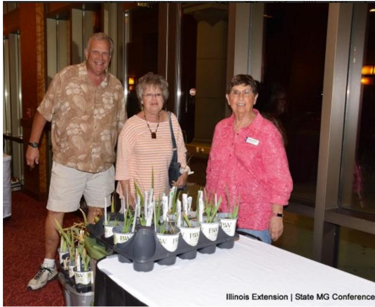
Attended State Master Gardeners Conference - East Peoria, IL