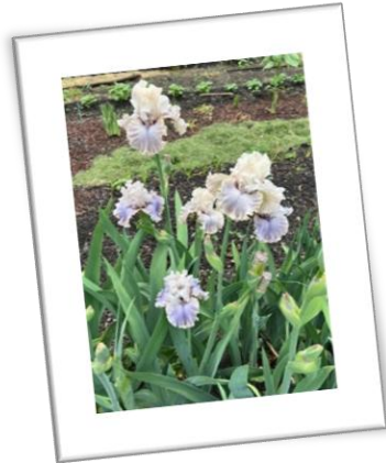
Haunted Heart Keppel 2016