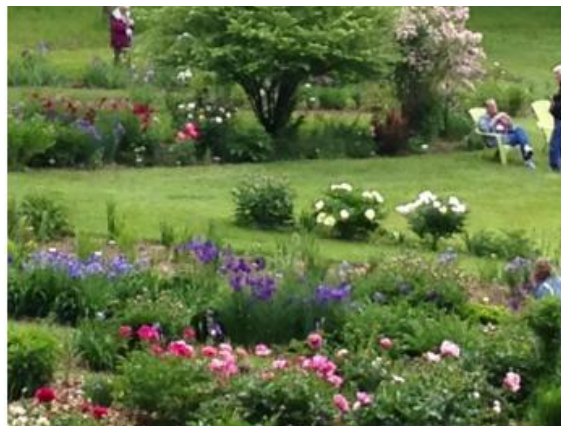
Siberian/Species Iris and AIS Region 21 Convention AIM for Ames for Irises May 23 & 24, 2025 Ames, Iowa

May 26, 2025 Northern Illinois Iris Society Morton Arboreum, Lyle IL Judging 10AM , open to public noon